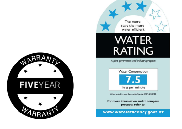
DESIGNED AND ENGINEERED IN GERMANY MANUFACTURED IN EUROPE