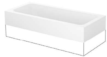
HIGHLINE BATH C/W WASTE 1800 x 800mm BET3313 CFXXH KIT