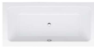
DROP-IN BATH Rectangular 1700 x 700mm BET3312-000