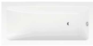
RELAX DROP-IN BATH 1800 x 800mm BET3323-000