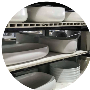
DAY 9 Cooking