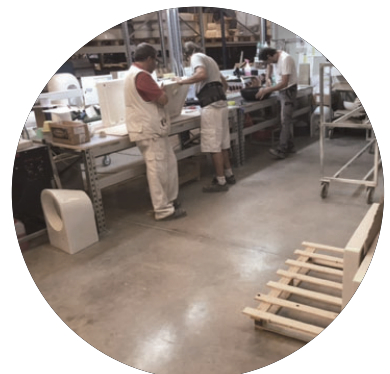
DAY 10 Checking