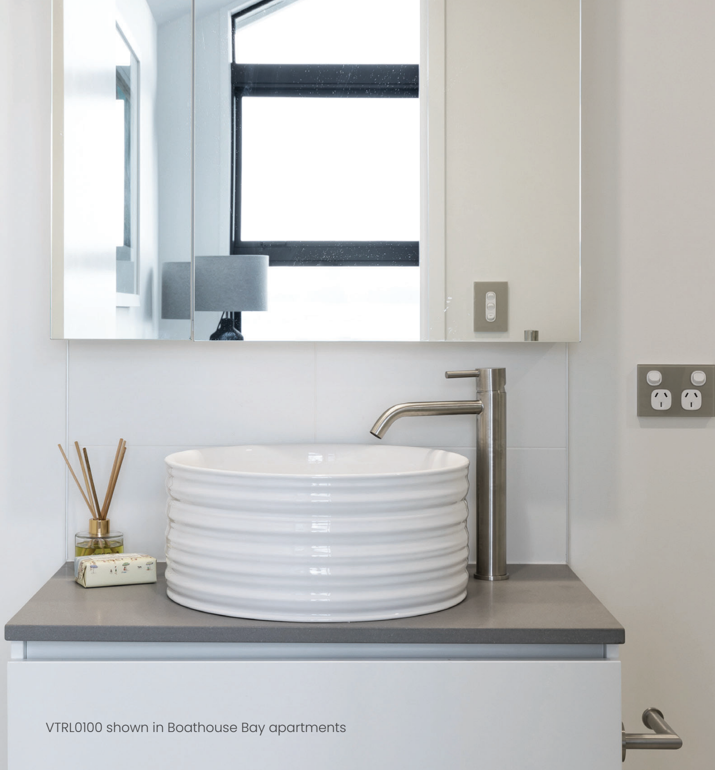
VTRL0100 shown in Boathouse Bay apartments