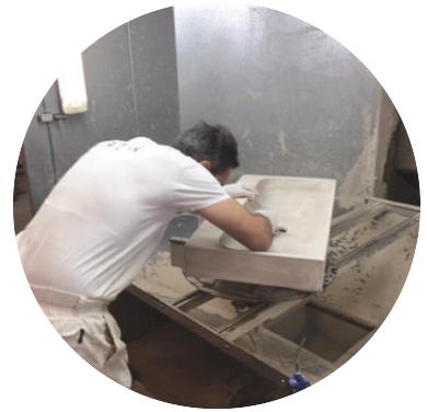
DAY 4 Product Finishing