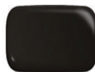
MATT BLACK 03