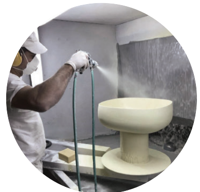
DAY 7 Enamelling