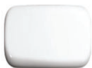
GLOSS WHITE 00