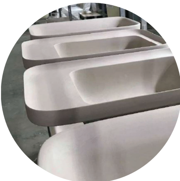
DAY 5 Testing & Engobbiatura