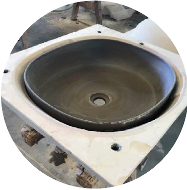
DAY 1 Casting

Valdama's traditional, non-mechanized production makes them unique in their sector. Each piece is followed throughout its creation phase, from the modeling process to the choosing of the item, under the supervision of qualified and certified individuals.