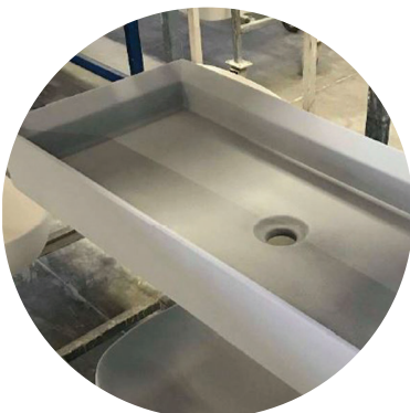
DAY 8 Enamel Drying