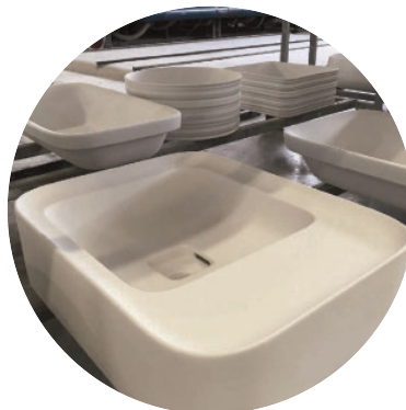
DAY 6 Drying